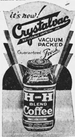
Cutout display of H and H Crystalvac Coffee.

The Hoffmann-Hayman Coffee company, pioneer Texas roaster of fine coffees, has again proved its local dominance in giving the housewife its famed H and H coffee in an entirely new and revolutionary type vacuum-crystal jar known as crystalvac, for which the appropriate slogan has been adopted: "It's Days Fresher, and It Stays Fresher." In addition to the supreme freshness afforded by this feature, the jar is reusable and particularly handy for the preserving of fruits, etc., and will take all standard lids such as Kerr and Mason-Ball.